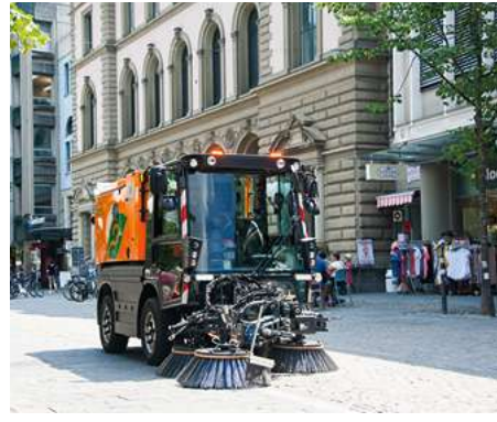
Swingo 200+ Sweeper